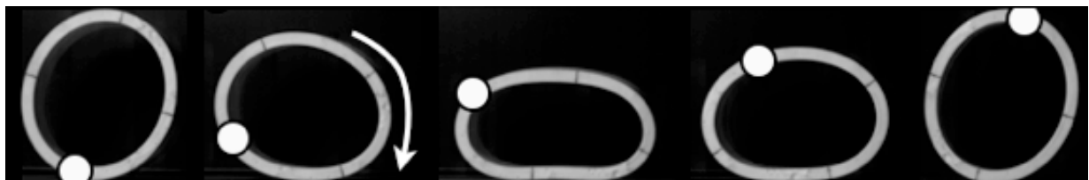
Rolling instability of a soft elastic wheel

These problems are also relevant to biological systems (such as the tank-treading instability of human red blood cells), microfluidic systems (where droplets experience periodic bouncing behavior on the channel boundary), or industrial applications (such as the standardized friction tests for rubber tires - Grosch-wheel model).